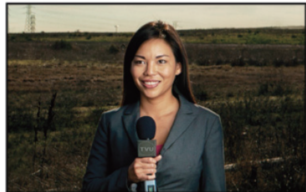
Inverse StatMux technology mitigates packet loss to ensure quality picture delivery despite unstable 3G/4G network conditions.