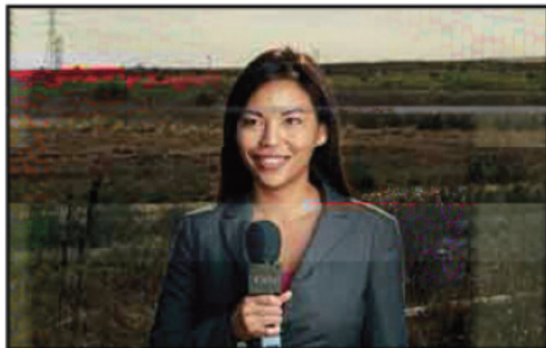
Packet loss can cause significant picture degradation with block artifacts or even complete loss of picture altogether.

The process of intelligently monitoring network conditions and dynamically adjusting the video compression rate in real time enables the TVUPack to match the video data rate with true available bandwidth, which in turn results in higher picture quality. The end results in terms of picture quality can be dramatic. Diagram B demonstrates common differences in picture quality when a signal is optimized with Invers StatMux versus an unoptimized signal transmitted using other mobile uplink technologies.